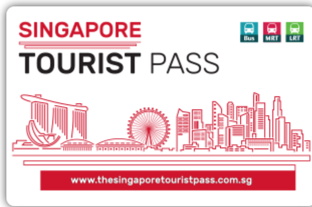
Singapore Tourist Pass