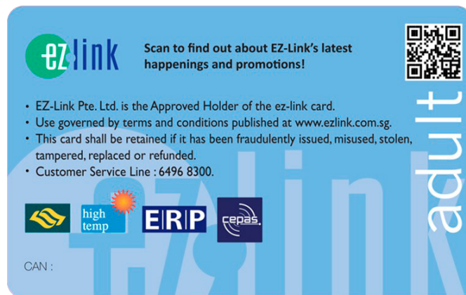
Adult Stored Value Smartcard - The EZ-link card